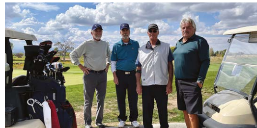
MCF Golf Team at the Alpine Bank Golf Invitational.