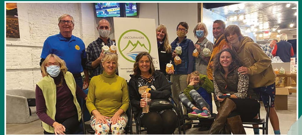
MCF invited nonprofit participants to a rally last November hosted by San Juan Brews and Coffee. At the rally we discussed Colorado Gives Day strategies, greeted the public with swag and granted $1000.

Visit ColoradoGives.org/UncompahgreGives or to support MCF directly, visit our Colorado Gives page at ColoradoGives.org/MontroseCommunityFoundation .