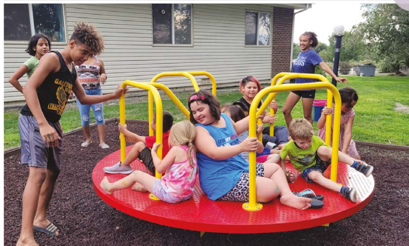
Children who live at Haven House enjoy some time outside on the new playground that was completed in April 2022.