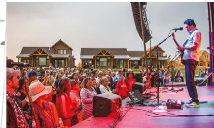
Concert goers enjoy an up close and personal performance by Big Head Todd & The Monsters.