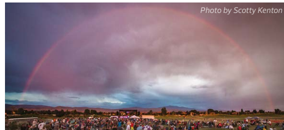
Big Head Todd & The Monsters at The Bridges.