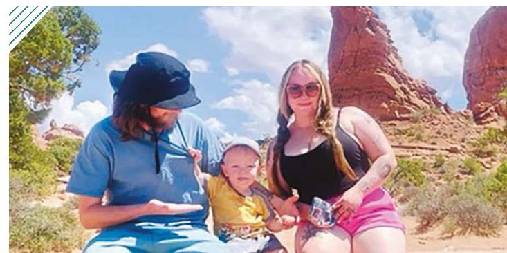
Local Community Options family enjoys a short trip to Moab from the Memory-Maker program.