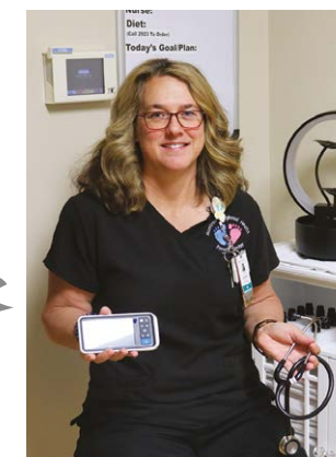
MRH caregiver shows off the new dedicated Sexual Assault Nursing Exam room.

Montrose Regional Health (MRH) used the grant dollars from Montrose Community Foundation to purchase equipment to treat victims of sexual assault with more dignity and respect. The Hospital dedicated a room where Sexual Assault Nursing Exams (SANE) are conducted, and the grant dollars were used to purchase equipment for that room. Equipment included a digital camera for recording the findings as well as some needed medical items to ensure there are no disruptions during the exam.