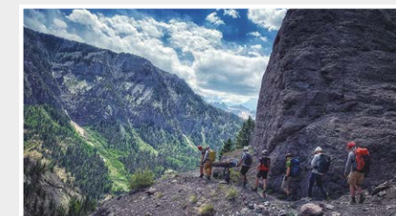
Volunteers from the Ouray Mountain Rescue Team transport Montrose resident from Bear Creek Trail.

Says one Montrose resident, "Can't express in words how appreciative I am to the wonderful rescue you performed hauling me off Bear Creek Trail after I ruptured my patella tendon! Everyone was so comforting and kind. Hopefully I'll never need you again but if ever I do, I hope you all are close by. Thank you from the bottom of my heart for all your work and dedication!"