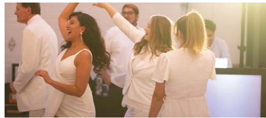
Guests enjoying the DJ at our Diner en Blanc gala.