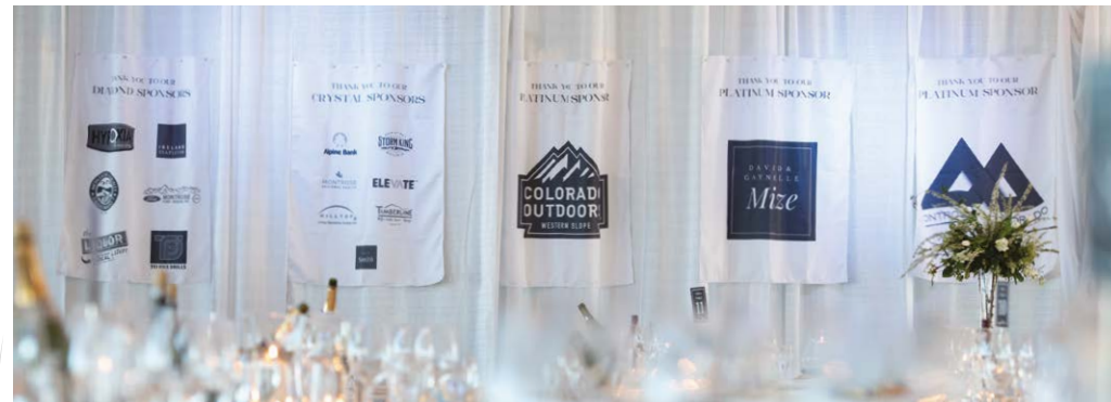
Generous Diner en Blanc Sponsors.